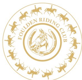
Horse 3 complete circle edge