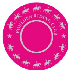
Horse 3 edge